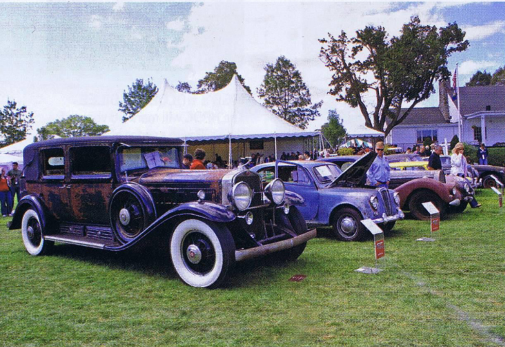
'As found' set was a Fairfield highlight, with (l-r): Cadillac V16, Lancia Appia and Bugatti T57

A special display of barn-find classics drew visitors' attention from the gleaming Best of Show competitors at the eighth Fairfield County Hunt Club Annual Concours d'Elegance in Westport, Connecticut, USA on 18 September.